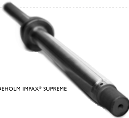
UDDEHOLM IMPAX® SUPREME

The Uddeholm High Performance Steel range includes steel grades that have unique properties. High strength, wear resistance and corrosion resistance, along with good heat treatment properties, are some of the benefits that add value to most applications.