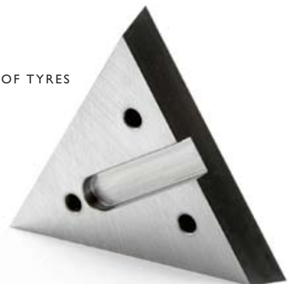
KNIFE FOR RECYCLING OF TYRES

Uddeholm Calmax knives used in recycling of white goods have resulted in strong productivity improvement. In the multiple-stage recycling of white goods such as refrigerators, several knives/blades of varying size are used. High demands are placed on the knives/blades concerning toughness, ductility and wear resistance. Uddeholm Calmax provides an excellent combination of these properties.